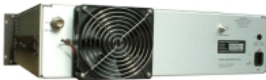
LSI 38STE Rear Panel View