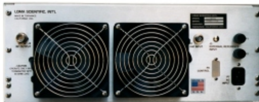
LSI 58STE Rear Panel View